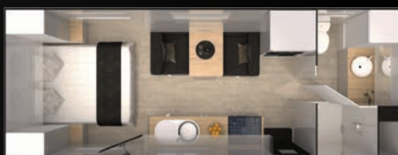
196R - Kitchen Door Side (Café)