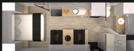
196R - Kitchen Road Side (Café)