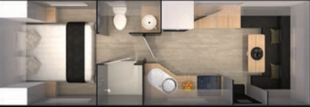
226R - Rear Club, Angled Kitchen (Flat Floor)