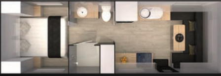
229R - Rear Club, Split Kitchen (Flat Floor)