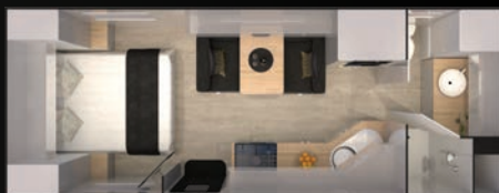
209C - Kitchen Door Side (Café/Pantry)