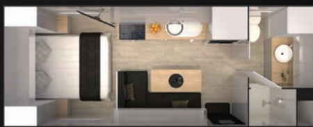
18R - Single Axle (L-Shape)