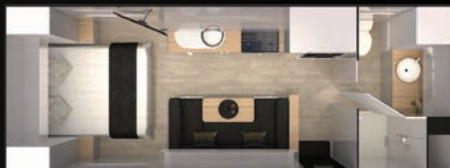
209R - Kitchen Roadside (Club)