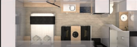
226R - East West Bed (Café)