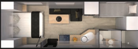
216C - Bunk, Angled Kitchen (L - Shape)