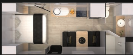
186C - Café (Flat Floor)