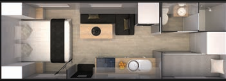
213C - Bunk (L - Shape)