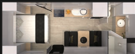
18C - Single Axle (Cafe)

● DAKAR ● ROUGH RIDER ● WRAITH ● BANTAM (Single Axle Only)