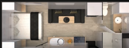
209R - Kitchen Door Side (Club)