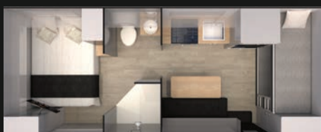
186R - Single Axle (Rear Bunk)