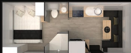
186R - Single Axle (Rear Club)