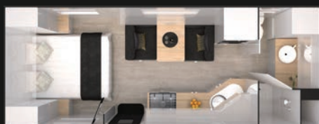
196C - Angled Kitchen Door Side (Café)