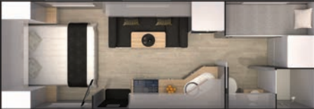
226C - Bunk Angled Kitchen (Club)