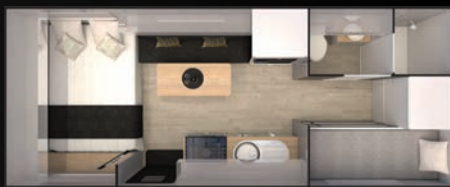
186F - Bunk Flat Floor