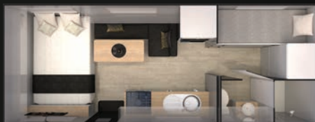
199F - Bunk (Flat Floor)