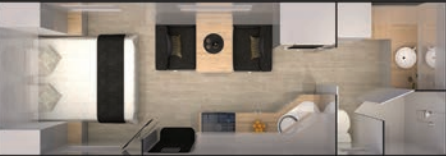
22C - Large Ensuite, Angled Kitchen Door Side (Café/Pantry)