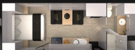
209R - Kitchen Door Side (Café/Pantry)