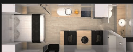
196C - Kitchen Road Side (Café)