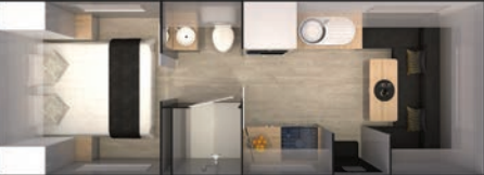
21R - Rear Club, Split Kitchen (Flat Floor)