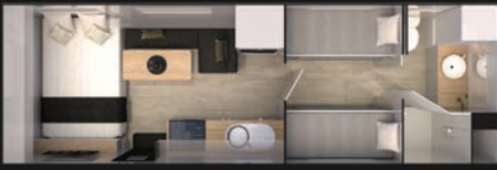
23F - Quad Bunk (Flat Floor)